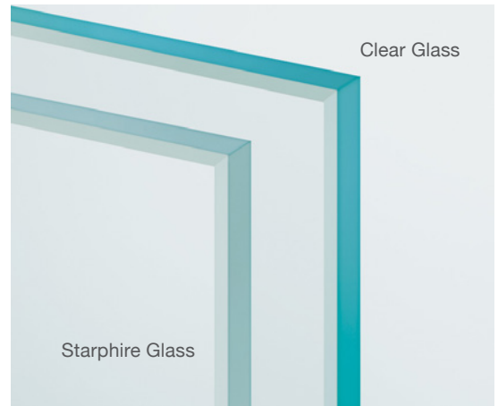
Difference between Clear and Starphire glass